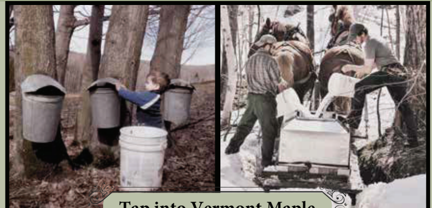
Tap into Vermont Maple